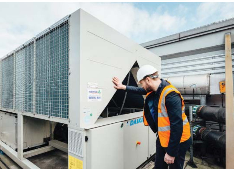
"The second weekend saw the removal of the remaining old unit and installation of the other Daikin chiller.